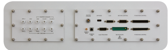
Complete AFM signal feedthrough enabling all AFM modes and accessories

Overcoming the chemical sensitivity challenge in green energy research requires the highest grade environmental control. Bruker has teamed up with MBraun, the leader in glove box systems and inert gas technology, to provide solutions for the most stringent atomic force microscopy environmental control requirements. The MBraun Labmaster series glove box, in conjunction with the MB 20G inert gas purification system, guarantees levels below 1ppm for both, oxygen and water. The integration of Bruker AFMs with this glove box enables seamless 1ppm gas control from sample preparation to characterization, so the sample is never exposed to an uncontrolled environment.