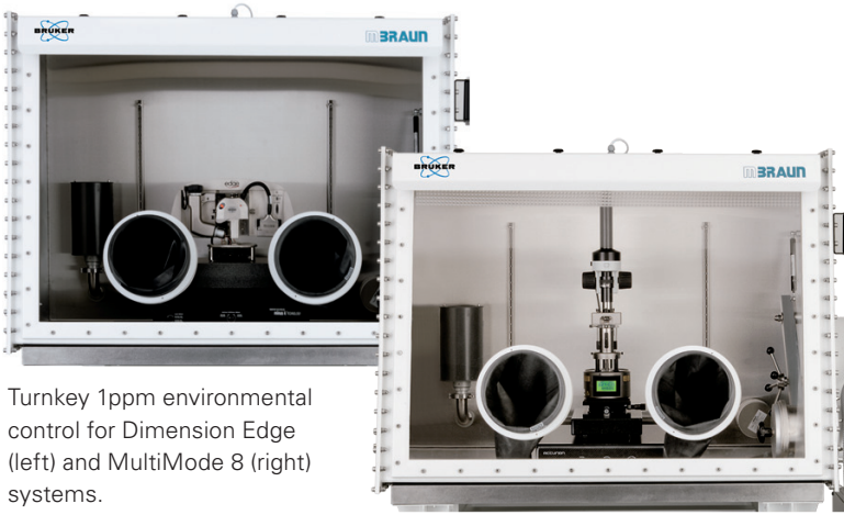
Turnkey 1ppm environmental control for Dimension Edge (left) and MultiMode 8 (right) systems.